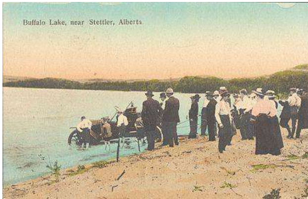
Postcard - early 1900s

Thank you for your understanding. If you want to see events like this in the future, please remember to raise your hand and volunteer.