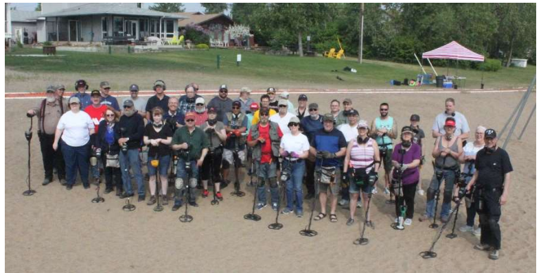
Rochon Sands Hunt - 2019