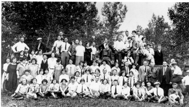
Jewish Literary club Picnic

The Glenbow Museum photographic archives have photos showing use of Shouldice Park in the 1920s, as it was a very popular spot.