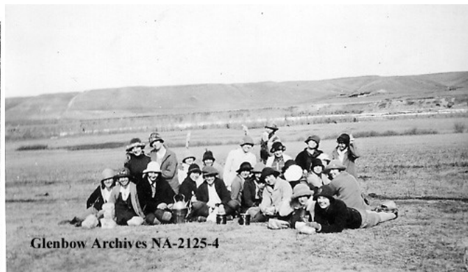
Normal School excursion