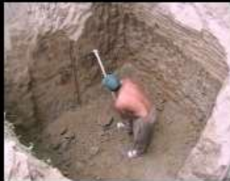
What my parents think I do.