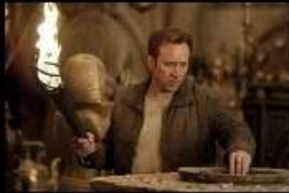
What I think I do.