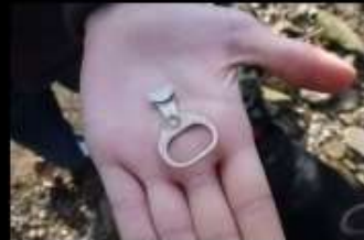
What I actually do.