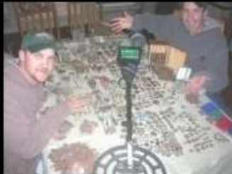
What my boss thinks I do.